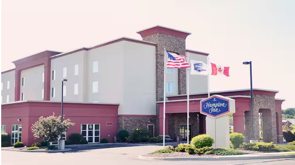
Hampton Inn Watertown

155 Commerce Park Drive, Watertown, New York MAP